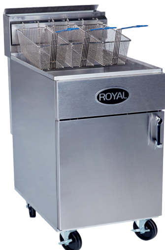
RFT-60 with optional casters